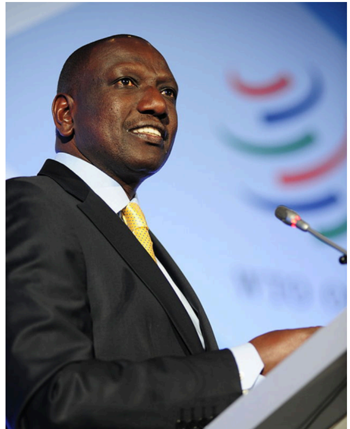
Kenyan President William Ruto at the WTO Public Forum in 2014

Young Kenyans have taken the lead by using social networks to raise public awareness. Hashtags such as #RejectFinanceBill2024 and #OccupyParliament have emerged on Twitter, TikTok, Instagram and WhatsApp. A specific tool, called Finance Bill Chatbot, has been designed by a group of young Kenyan activists specialising in technology. This tool, based on ChatGPT, enabled citizens to ask complex questions about the bill 3 and obtain clear, detailed answers. It was used to simplify the technical details of the legislative text, break down language barriers by translating information into several local languages, and counter misinformation about the bill. Another innovative strategy was to publish MPs' telephone numbers so that citizens could contact them directly. This approach attracted national and international attention, amplifying opposition to the bill.